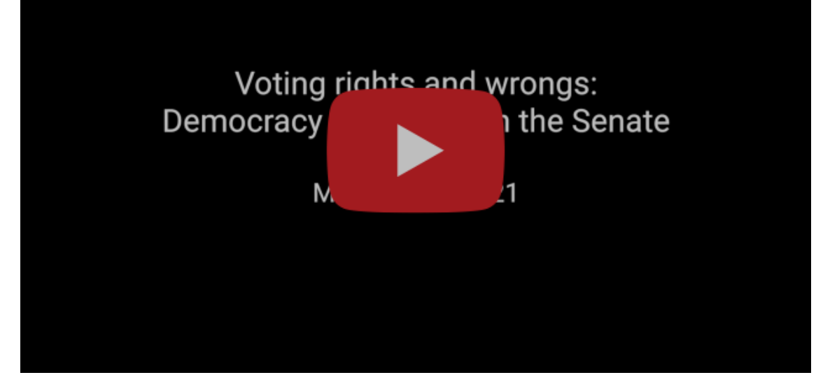
Voting Rights and Wrongs: Democracy Legislation in the Senate

Brookings held a webinar discussing H.R. 1, For the People Act of 2021. Read below Brooking's description below: